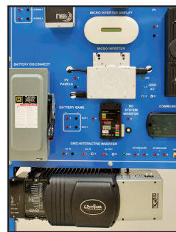
Grid-Connected & Micro Inverters

Amatrol's 950-SPT1 includes a micro inverter in addition to the grid-tie inverter. This is also a very popular option that is frequently used to assign an inverter to each PV string. Both of these inverters are required to teach skills across all major types of AC systems including stand-alone AC, grid-connected AC, and grid-connected AC with storage.