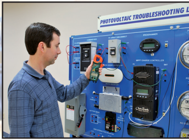
Student Reacting to Electrical Fault

can identify specific areas the student needs to improve and target those areas. It also allows instructors to set-up faults ahead of time, allowing students to perform self-directed study when appropriate.