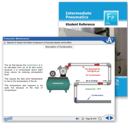
Interactive Multimedia and Student Reference Guide