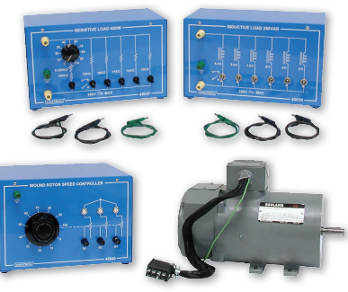
The 85-MT2B and 85-MT2D

The 85-MT5C is just one option for electrical machine training from Amatrol. Other options to add onto the Basic Electrical Machines Learning System (85-MT2) include DC Generators (85-MT2B) and Wound Rotor Motor (85-MT2D). The 85-MT2B includes a restrictive load unit and an inductive load unit to cover topics like performance measurement, performance analysis, and DC series, shunt, and compound generators. The 85-MT2D includes a wound rotor controller and motor to cover topics such as speed controllers, motor reversing, and performance analysis and measurement.