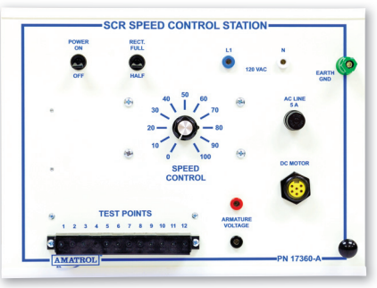
85-MT5F Control Panel

Amatrol's DC Drive with SCR Speed Control Learning System (85-MT5F) is built with components that are both heavy-duty to stand up to frequent use and industry-standard so that learners can gain real-world experience. The 85-MT5F includes a slide-in, pre-wired, 11-gauge steel panel with an SCR speed control unit, speed control adjustment, fuse block, full/half wave rectification switch, and a 1/4 HP DC shunt wound motor. The SCE speed control unit provides adjustable current limit with LED indicator, IR voltage compensation to provide 1% speed regulation throughout 60:1 speed range, minimum and maximum speed settings, and adjustable linear acceleration and deceleration times.