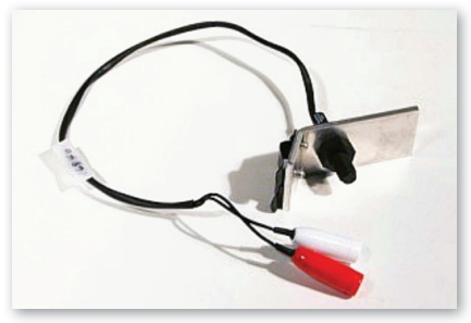
Electronic Reed Sensor

Electronic sensors are used in industrial applications for feedback from systems like electrical relay controls and programmable logic controllers. Learners practice real-world skills on standard industrialgrade components to gain practice and familiarize with actual components that they'll find on the job. As examples, the 85-SN1 allows learners to build relay circuits that separate non-metallic and metallic materials, design controls for a stamping machine, and use a sensor as a safety interlock.