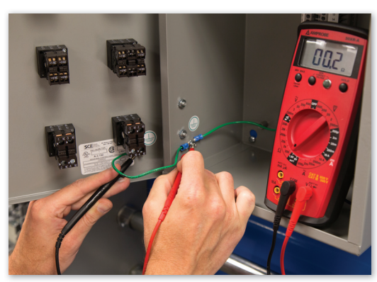
Voltage Check Using Multimeter

push-to-test buttons; and much more all on a mobile workstation! These industrial components can be used to practice an array of hands-on skills like installing a terminal block in an electrical panel; splice motor leads using ring lug connectors; bundle wires in an electrical panel; manually operate an electro-pneumatic valve; and select circuit protection for an application. These real-world industrial wiring components will allow learners to gain confidence and competence in working with equipment they'll actually see on the job.