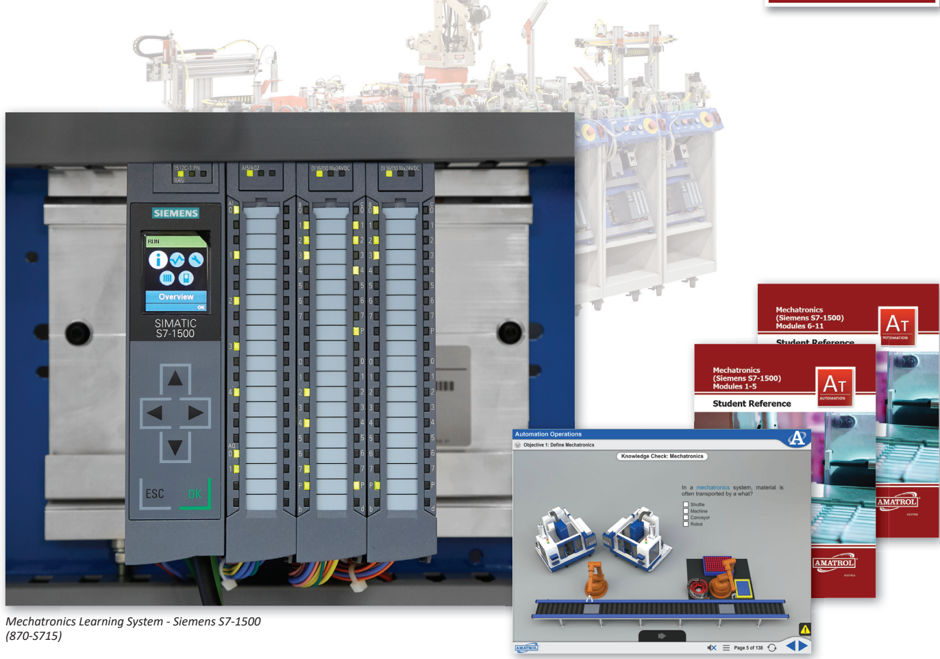
Interactive Multimedia Curriculum and Student Reference Guides