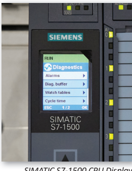
SIMATIC S7-1500 CPU Display

The Siemens S7-1500 learning system's major component is the SIMATIC S7-1500 PLC. Learners will use the PLC with Amatrol's Mechatronics carts, a computer, and STEP 7 PLC programming software to build the most real-world applicable skills possible! The Siemens S7-1500 learning system allows learners to design a variety of PLC programs including: manual/auto/reset functions; discrete I/O handshaking for multiple station quantity production; and sequencing various mechatronics station applications like part transfer modules, part insertion modules, and a non-servo electric traverse axis.