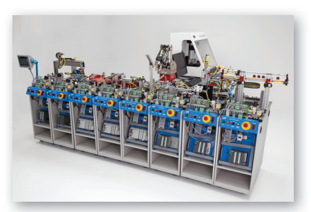
Amatrol's Mechatronics Learning Systems

The Siemens S7-1500 learning system can be used with any or all of Amatrol's Mechatronics carts, which include Pick and Place Feeding (87-MS1), Gauging (87-MS2), Orientation Processing (87-MS3), Sorting/Buffering (87-MS4), Servo Robotic Assembly (87-MS5-P2), Torque Assembly (87-MS6), and Inventory Storage (87-MS7).