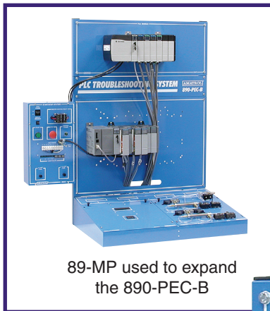
89-MP used to expand the 890-PEC-B