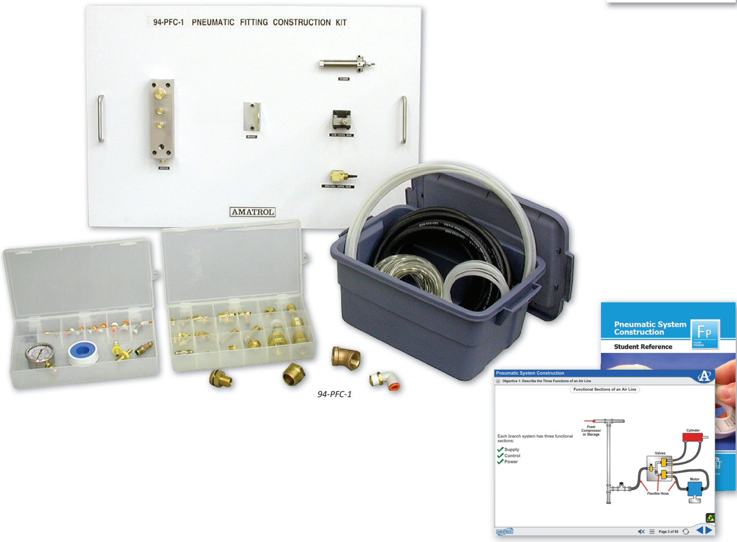
Interactive Multimedia Curriculum and Student Reference Guide