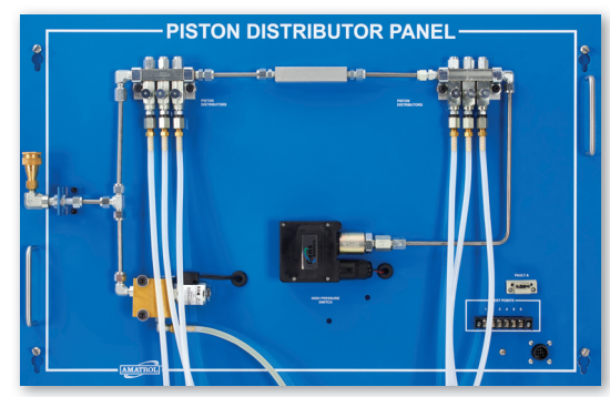
Piston Distributor Lubrication System Panel

The 950-CL1 features real-world, industrial-quality central lubrication components, including an electric pump, programmable system controller, and both piston distributor and series/progressive valve lubrication systems. Users will learn how to operate the electric pump, program the controller, and troubleshoot central lubrication systems, gaining hands-on practice with equipment they'll encounter on the job.