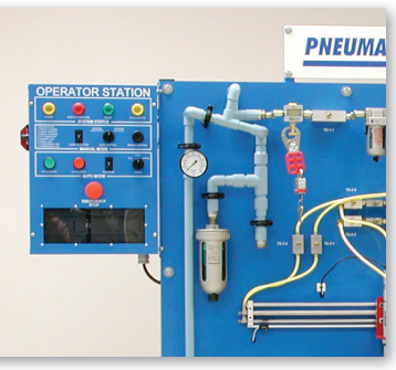
950-PT1 Operator Station

The 950-PT1 teaches pneumatic troubleshooting effectively because it operates under actual load conditions. Each application exposes learners to a different type of load, including inertial, friction, compression, and static loads. The system gives learners experience with situations they will actually encounter on the job. Each of the major circuit panels replicates a common application. The PLC control offers a variety of selectable programs to change sequences, presenting learners with different troubleshooting scenarios.