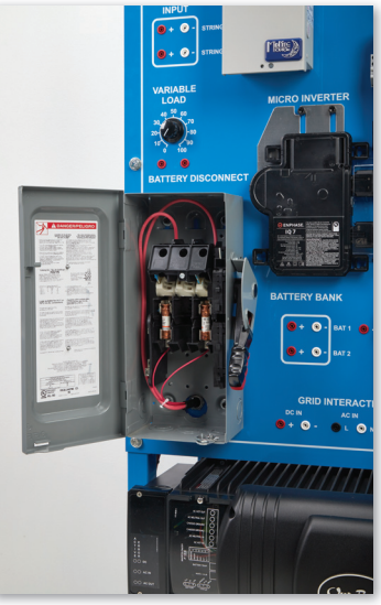
Micro-Inverter & Battery Disconnect on 950-SPT1

Amatrol's 950-SPT1 includes power distribution panels, a combiner box, disconnects, and circuit breakers that are essential to create realistic solar photovoltaic systems and troubleshooting situations. The system also includes a micro-inverter in addition to the grid-tie inverter. This is a very popular option that is frequently used to assign an inverter to each PV string. Both of these inverters are required to teach skills across all major types of AC systems including stand-alone AC, grid-connected AC, and grid-connected AC with storage.