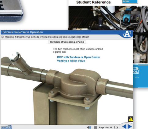
Interactive Multimedia Curriculum