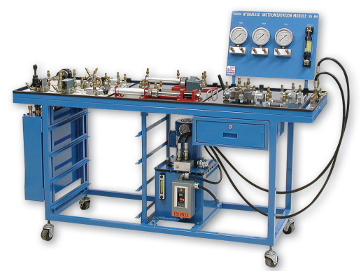
96-HYD1 with 96-HYD2

Building upon the Hydraulics 1 and 2 Learning Systems, the 96-HYD3 teaches learners a variety of advanced hydraulic concepts and skills. For example, learners will study hydraulic relief valves, check valves, and accumulators. Relevant skills taught include connecting a pilot-operated relief valve to unload a pump by venting, calculating the pilot pressure required to open a POC valve, and designing an accumulator circuit to compensate for leakage.