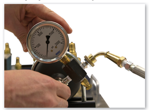
Hands-On Practice with Real-World Equipment

The 96-HYD3 uses the same Intermediate Hydraulic Valve Module as the 96-HYD2, which features a variety of real-world, industrial-quality hydraulics components that learners will encounter on the job. These components include an accumulator, control valves, relief valves, flow control valves, and check valves. Users will practice relevant hands-on skills like connecting and operating pilot-operated relief valves and P-port check valve circuits.