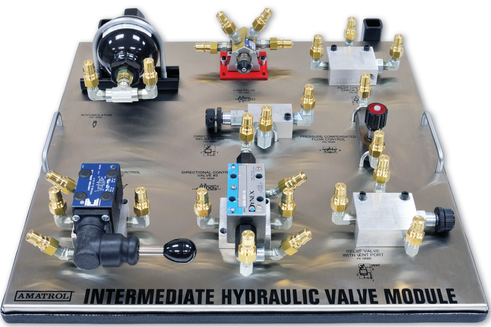
The Hydraulics 3 Learning System uses the Intermediate Hydraulic Valve Module (85-IH).