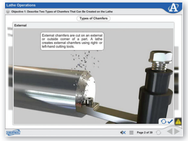
96-MP3 Multimedia Showing Types of Chamfers in Lathe Operation

In addition to the knowledge and skills presented in this learning system, Amatrol offers even more Machine Tools training! Machine Tools 3 (96-MP3) focuses on the manual lathe through topics like: roughing and finishing operations, cutting chamfers, grooving operations, and threading operations.