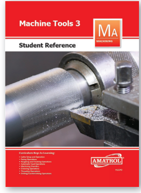
Student Reference Guide