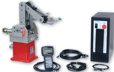
Peaasus II Robot with Computer Controller

The 96-ROB1A features a powerful, 5-axis Pegasus II articulated servo robot arm with a gripper. This robot features a double-jointed arm with a 360-degree work envelope, increasing work cell efficiency. Industrial-quality repeatability, highresolution encoders, infrared homing sensors, and multiple microprocessors allow this robot to also perform precise industrial tasks, such as assembly. The system also features a state-ofthe-art teach pendant with a two-line display, emergency stop button, jog capability, and four