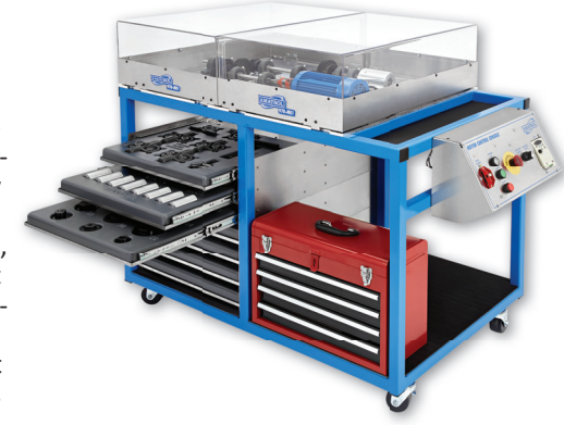
Requires 970-ME1 and 97-ME2

Misalignment of power transmission system components is a major cause of excess wear and premature machine failure. When a misaligned machine is allowed to operate uncorrected, the resulting vibration will eventually cause bearing, shaft, seal, and coupling failure. This is why laser alignment systems are so vital. Within the Laser Shaft Alignment Learning System, learners will practice hands-on laser alignment skills, such as: install and align a power transmission system using a jack bolt motor base; using a laser alignment system to correct soft foot; and determine shaft alignment tolerances for a given machine installation.