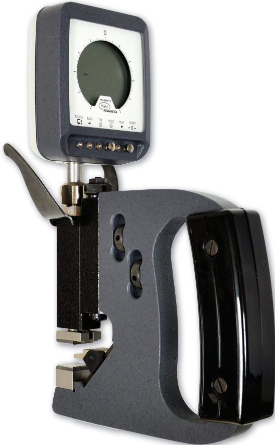
Snap Gauge (99-PG2)