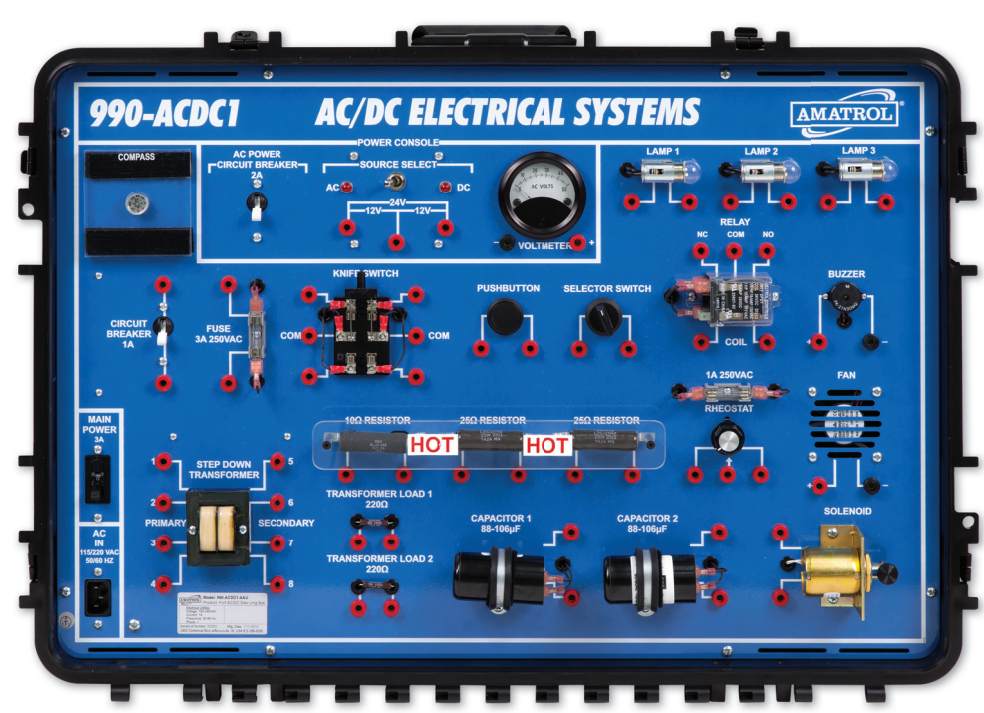
Portable AC/DC Electrical Learning System