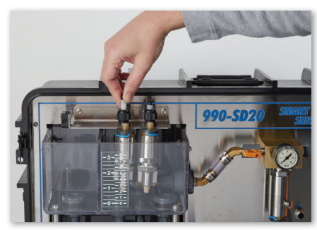
Hands-On Skill Building with Smart Sensors

SD20 curriculum teaches learners about the history of IIoT and how it is being implemented via a variety of advanced technologies in industrial settings, especially those involving process control applications. Students will also learn about cloud computing, edge and fog computing, data analytics, and smart sensors. The 990-SD20's convenient portable console will allow students to learn about the operation and function of smart pressure and level/flow sensors in process control.