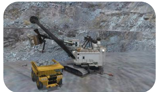
Truck loading by the interactive Electric Rope Shovel