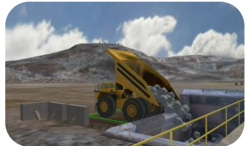
Mastering the use of the hoist control for dumping