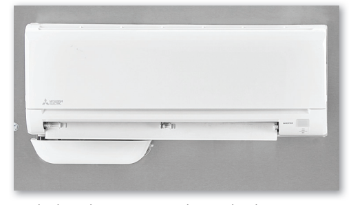
Real industrial components give learners hands-on experience

When it comes to learning important residential mini-split heat pump system skills, there's simply no substitute for hands-on experience with real equipment that technicians will encounter on the job. That's why Amatrol's Residential Mini-Split Heat Pump Learning System features real industrial HVACR equipment, including a heat pump condenser, evaporator unit, and condensate pump. The T7130 was also designed to include transparent housings and pipes with LED illumination that allows learners to see inside the system.