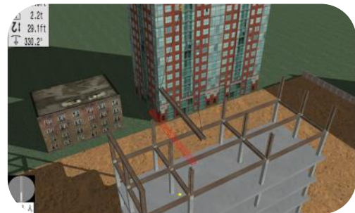
Positioning girders at target positions as part of steel erection