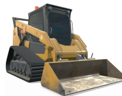
Compact Track Loader