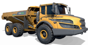
Articulated Dump Truck