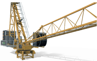
Luffing Tower Crane