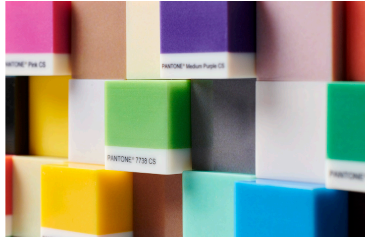
Pantone color blocks